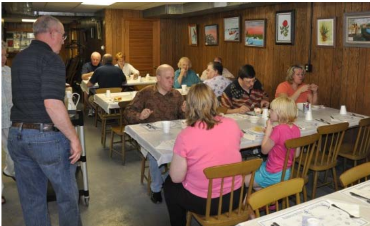
A few of the brethren and their families from our Annual Strawberry Festival on 6-27-09