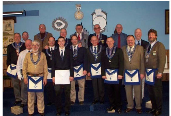
Also participating in the work of the evening